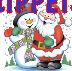
Christmas joy warms the heart

The children thoroughly enjoyed the Christmas Party in their own playgarden. There was such a vibe of excitement and happiness throughout the day. The Children didn't want to go home!!